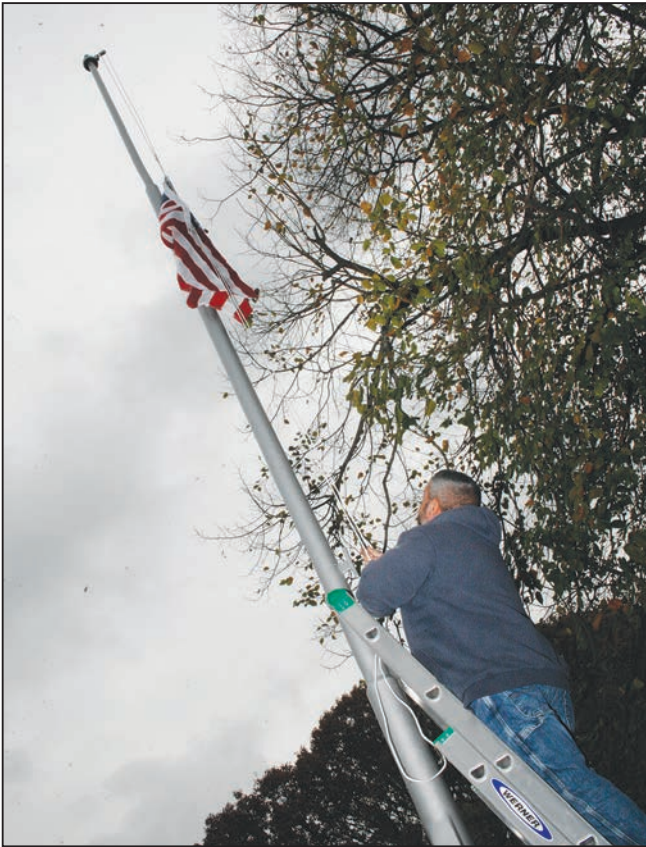
City workers raise the special, 35-star flag that was used during the Civil War.