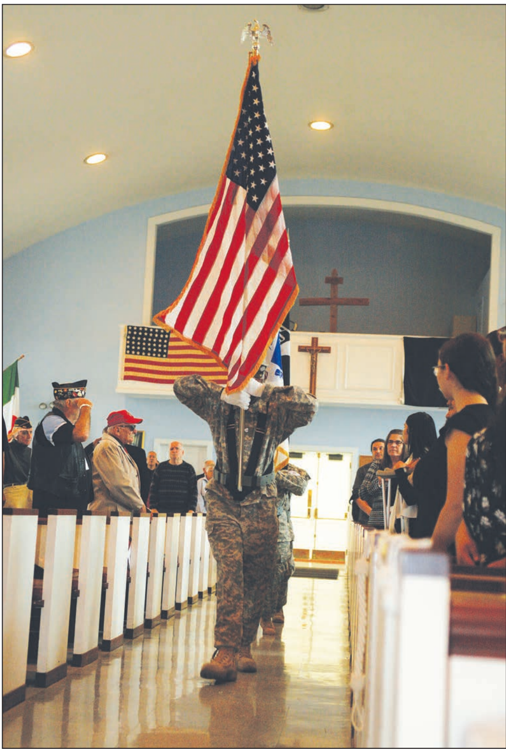
The Soldiers' Home Color Guard marched proudly into St. Michael's.