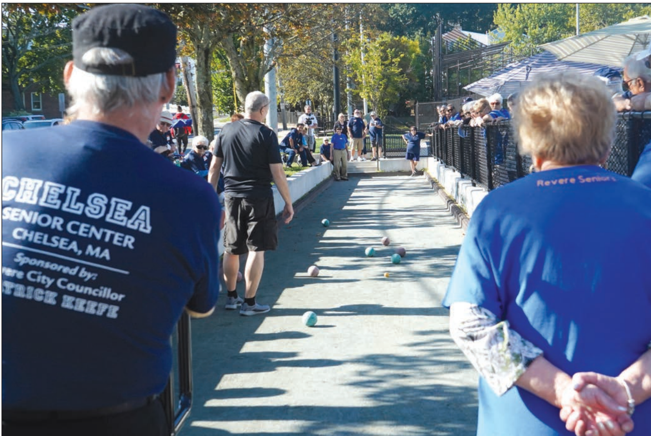
Chelsea and Revere faced off in the 3 rd annual Bocce Bowl Tournament Saturday, Sept. 28.