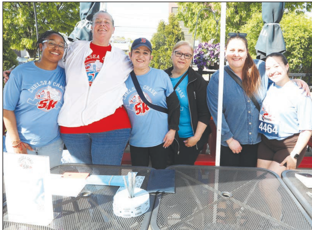
Volunteers at the registration table greet many runners for the event.