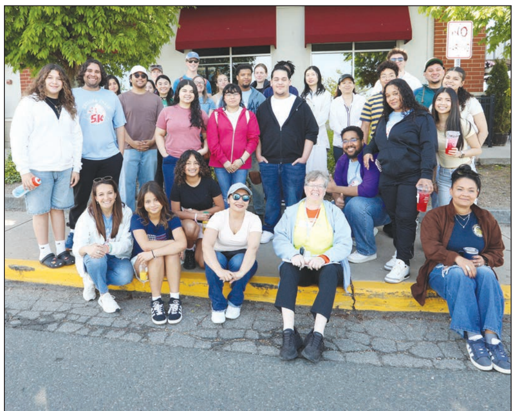
Many volunteers are needed to provide safety and guidance for the annual event.