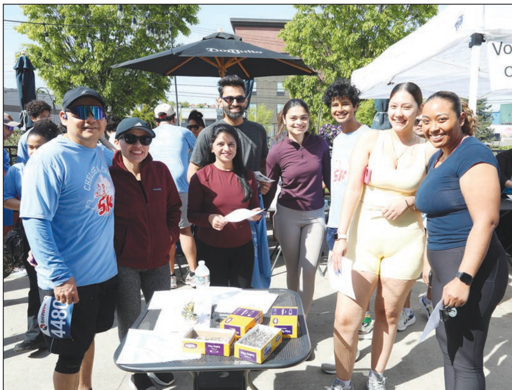
Checking in and ready for the race, many participants enjoying a beautiful spring morning in Chelsea.