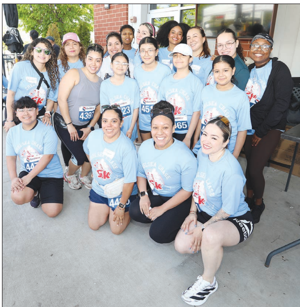
Lots of smiling faces at the Chelsea Chase.