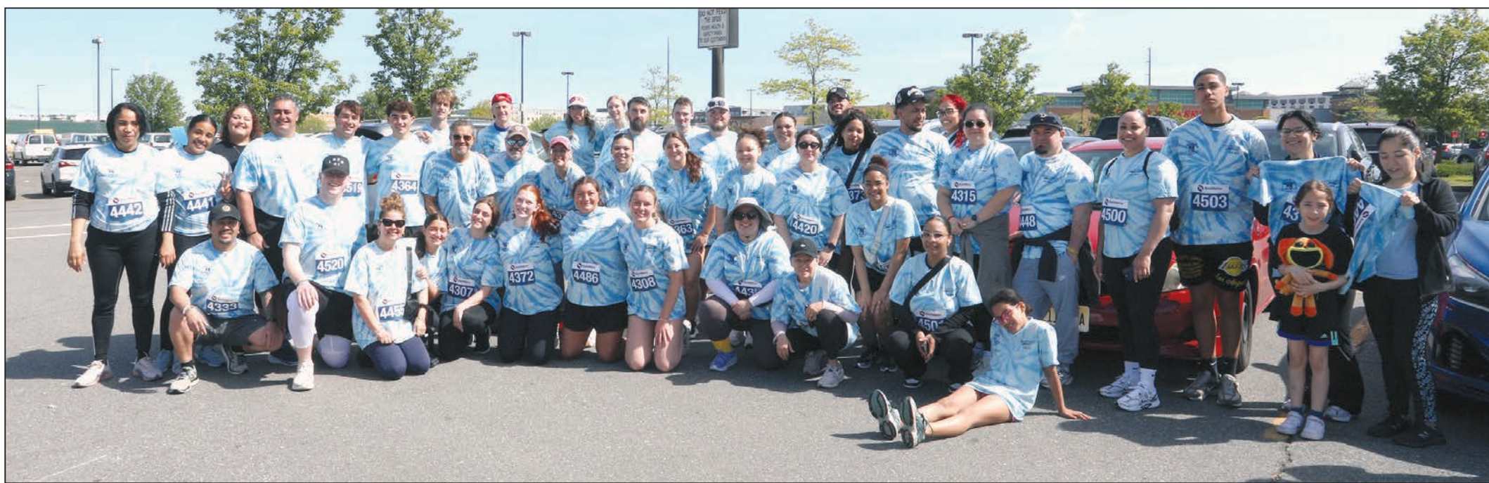
Performance Physical Therapy of Chelsea, Revere, and Winthrop had a huge turnout supporting the Jordan Boys and Girls Club last Saturday morning.