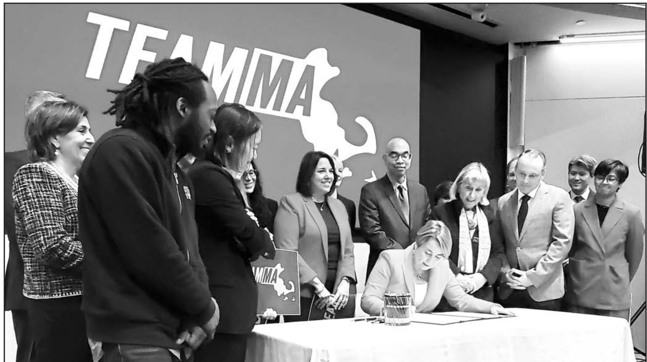
Governor Healey signing the Economic Development bill.

the conference committee for my residents and our entire state." for helping pass this important piece of legislation