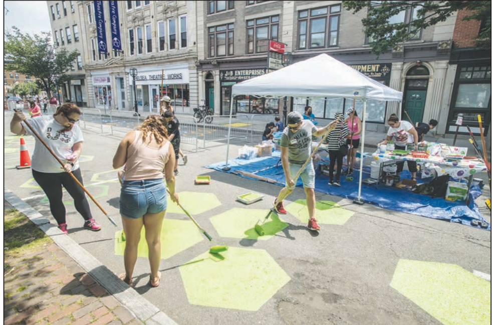
Volunteers busy as bees painting in a honeycomb pattern on Winnisimmet Street in Chelsea Square. See page 13 for more photos.

The City Of Chelsea with the help of volunteers and Neighborways, a consulting firm for urban beautification, have organized a Paint Day on Winnisimmet Street in Chelsea Square June 19. A painted honeycomb pattern was chosen to compliment individual pieces commissioned to local artists. Along with similar work on Division Street, the project hopes to celebrate Welcome, Inclusion, and Diversity by increasing safety for pedestrians and cyclists to safely enjoy the area as well as to encourage pop-up events.