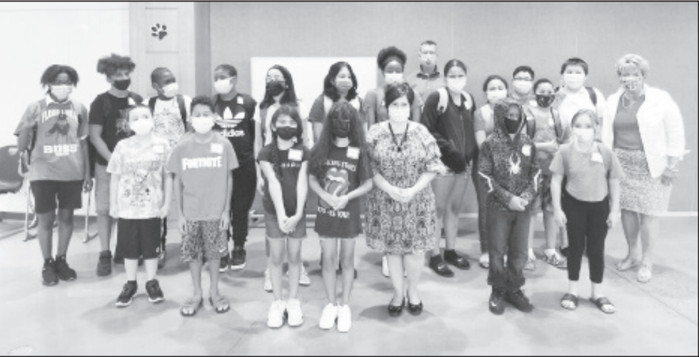
Local children sponsored by the Rotary Club of Chelsea to one week at Camp Rotary.

person of this Rotary project. She works with the Chelsea Public Schools to distribute the applications to Chelsea students, coordinates transportation to and from camp with the Chelsea Police Department and makes sure all the children are properly prepared to attend camp. That includes supplying each child with a backpack filled with items they will need for camp. Since 1998 the Rotary Club of Chelsea has sponsored over 375 Chelsea students at Camp Rotary thanks to the generosity of the Chelsea Club members and local businesses.