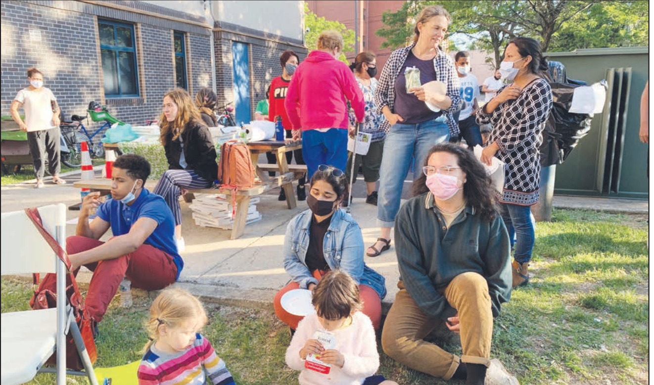
Community members enjoying the evening on Mill Creek.