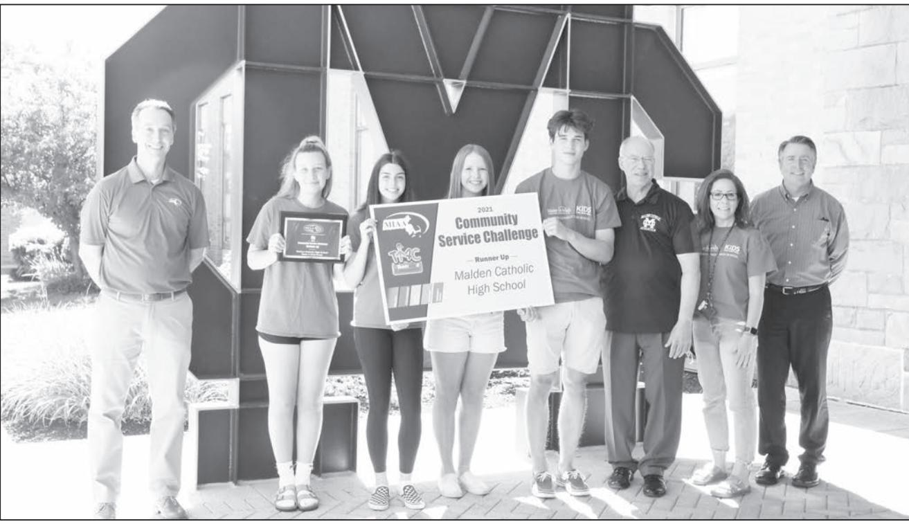
Malden’s Make-A-Wish Club event won second place (runner up) in the 2020 – 2021 MIAA Community Service Challenge.