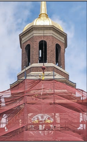
The faces of the restored clock on the City Hall Clock Tower were lowered into place last Saturday, June 26, as the full restoration of the tower hit a major milestone. The top of the tower has now been outfitted with new gold leaf coating and the clocks are now in place and will keep good time from here on out. The project will now wind down and the scaffolding will be removed. The project should be complete by the end of July.