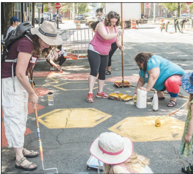
Volunteers busy as bees painting in a honeycomb pattern on Winnisimmet Street in Chelsea Square.