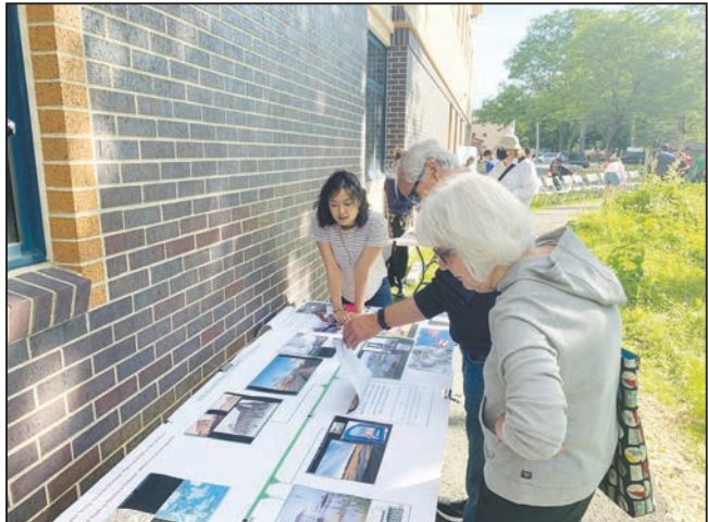
Community members visiting one of the visioning sessions.