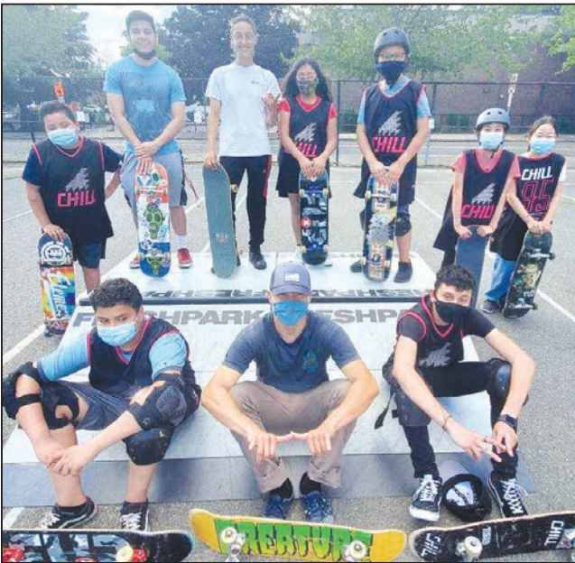
The Chill Foundation (Chill) partnered with Chelsea Recreation Division to offer a 3-day Skateboard Program to youth ages 10-18, this past June. Approximately 10 Chelsea young people participated.