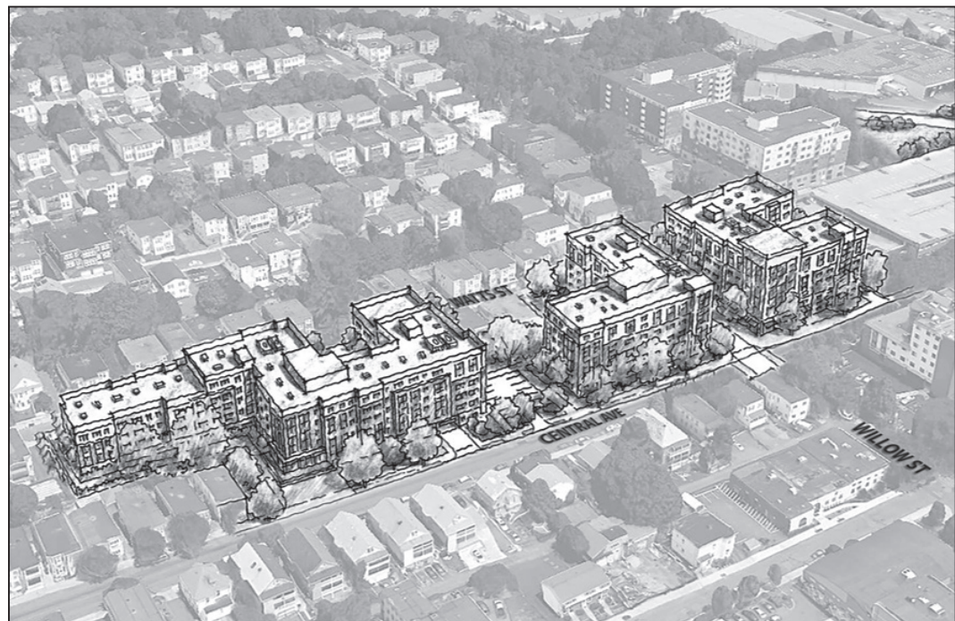
A rendering of the early drawings of the new project, where buildings are about three stories to the west and up to six stories as they approach the parking garage.

The process will kick off at the Nov. 20 meeting.