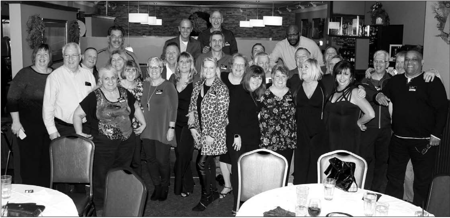
Members of the CHS Class of 1978, pictured at their 40th Class Reunion at Capone's, Peabody.

The Chelsea High School Class of 1978 celebrated its 40th Reunion on Nov. 9 at Capone's in Peabody.