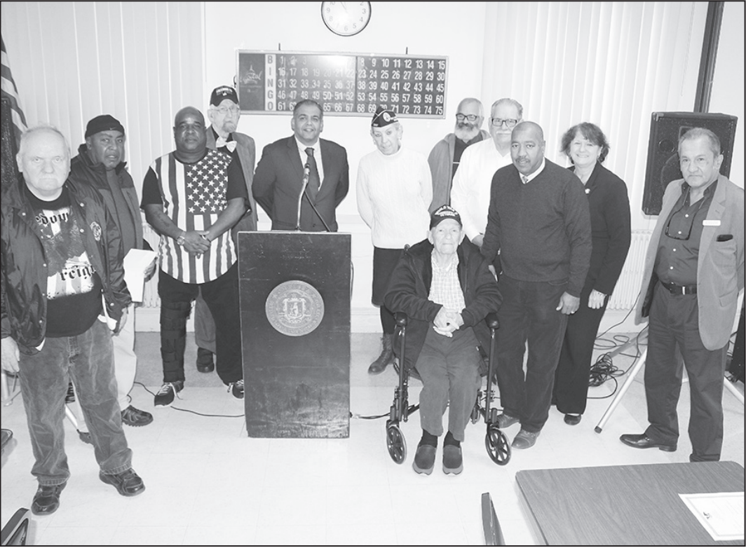
The veterans in attendance gathered for a photo before the City of Chelsea Veterans Day Ceremony Monday at the Chelsea Senior Center.