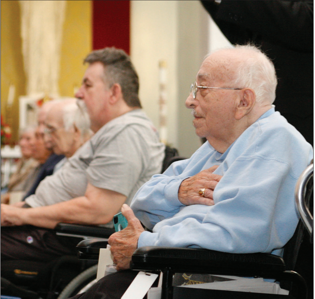
One of the Soldiers' Home residents puts hand over heard during the Pledge of Allegiance.