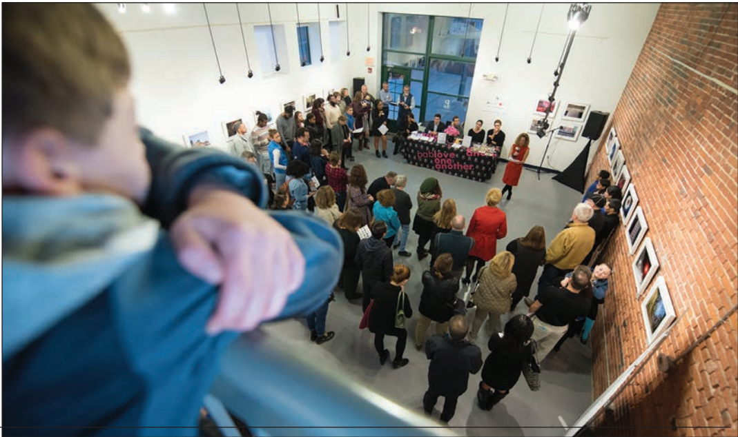
The Gallery @ Spencer Lofts welcomed more than 100 visitors for the Pablove Foundation's Shutterbug program.